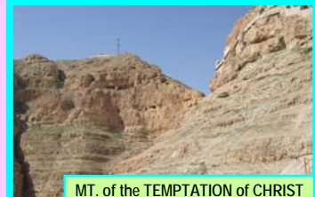
MT. of the TEMPTATION of CHRIST

• Direct return flight London Heathrow-Tel Aviv: depart from Heathrow 10.30pm 9 th April (1 st night + 7), return to Heathrow 8.20pm 17 th April • Modern air-conditioned coach • Free time • Resident 3 nights in Nazareth and 4 nights in Jerusalem • Chaplain: a priest Franciscan Friar of the Immaculate