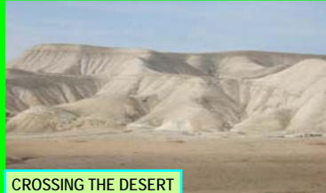
CROSSING THE DESERT