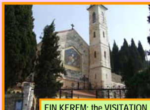
EIN KEREM: the VISITATION