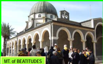
MT. of BEATITUDES

Organised by: A DAY WITH MARY APOSTOLATE. Catholic Registered Charity (UK) No. 1071603