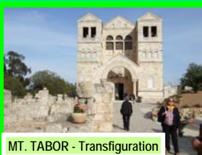
MT. TABOR - Transfiguration

BASILICA of the ANNUNCIATION our residence is 200 yards away