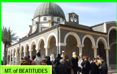
MT. of BEATITUDES

Organised by: A DAY WITH MARY APOSTOLATE. Catholic Registered Charity (UK) No. 1071603