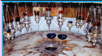
BETHLEHEM: JESUS'S BIRTHPLACE