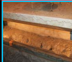
OUR LADY'S SEPULCHRE

• Accommodation in Christian Quarter of old Jerusalem, walking distance from the Holy Sepulchre and many of the important sites and the Via Dolorosa. Our tour guide is a Franciscan priest, expert in Biblical, archaeological and historical studies of the Holy Land