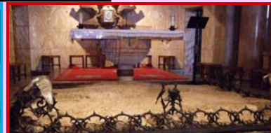
ROCK of JESUS'S AGONY