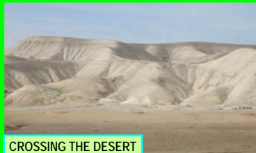
CROSSING THE DESERT