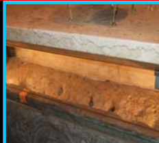
OUR LADY'S SEPULCHRE

CHURCH of the HOLY SEPULCHRE our residence is a few minutes walk away