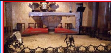
ROCK of JESUS'S AGONY