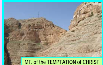
MT. of the TEMPTATION of CHRIST

• Direct return flight London Heathrow-Tel Aviv: depart from Heathrow 10.30pm 9 th April (1 st night + 7), return to Heathrow 8.20pm 17 th April • Modern air-conditioned coach • Free time • Resident 3 nights in Nazareth and 4 nights in Jerusalem • Chaplain: a priest Franciscan Friar of the Immaculate