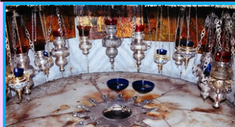
BETHLEHEM: JESUS'S BIRTHPLACE

CHURCH of the HOLY SEPULCHRE our residence is a few minutes walk away