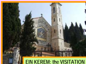
EIN KEREM: the VISITATION